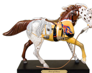
Best of Show