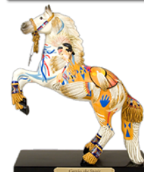
Carries the Spirit