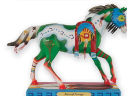
Rites of Passage

Artist: Black Pinto Horse, Monte Yellow Bird Sr.