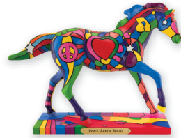
Peace, Love & Music