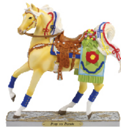
Pony on Parade