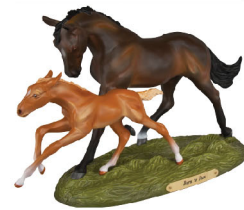
Born to Run