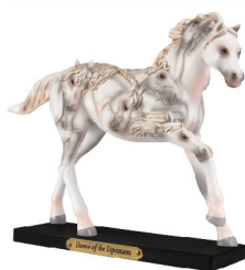
Dance of the Lipizzans