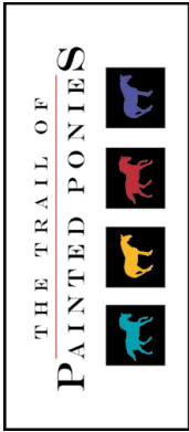
Submission Form (Front)