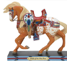
Pride of the Nez Perce