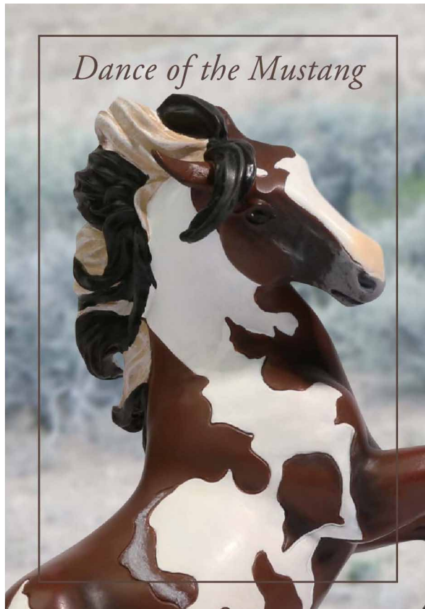
Dance of the Mustang