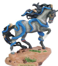
Legend of the Blue Horse