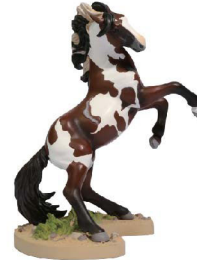
Dance of the Mustang