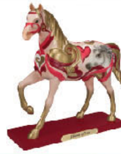
Ribbons of Love