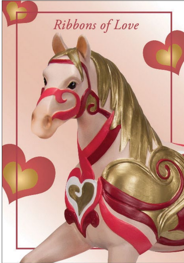
Ribbons of Love