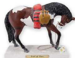
Trail of Tears