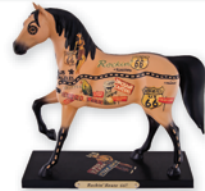
Rockin' Route 66!