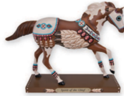
Spirit of the Chief