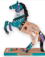
Navajo Sand Painter