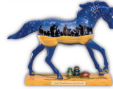
Gold, Frankincense and Myrrh