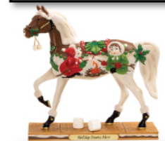
Holiday S'mores and More