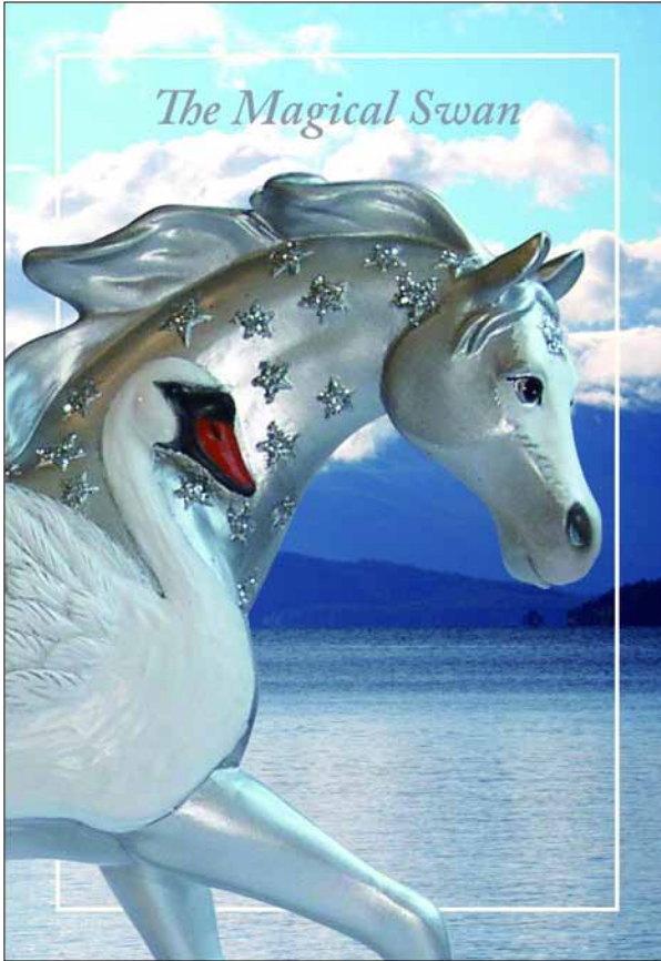
The Magical Swan