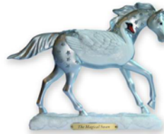
The Magical Swan