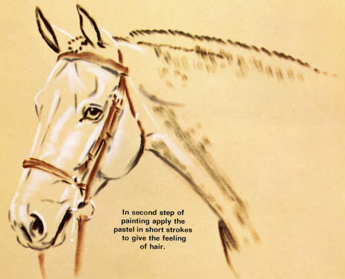
In second step of painting apply the pastel in short strokes to give the feeling of hair.