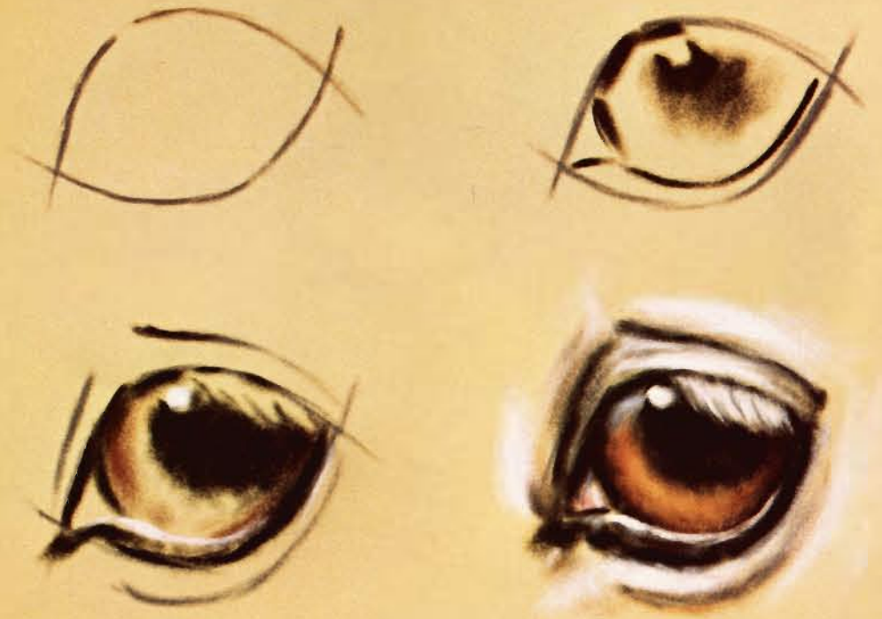
I have shown the pupil fully opened as the slit-shaped pupil is distracting in art.