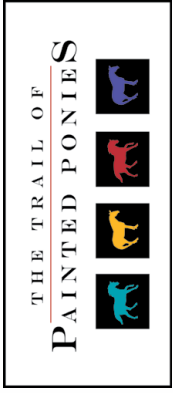
Submission Form (Front)