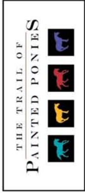
Submission Form (Front)