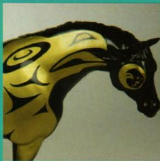
Night Flight Ed NoiseCat