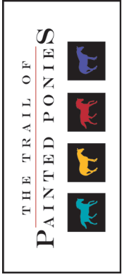
Submission Form (Front)